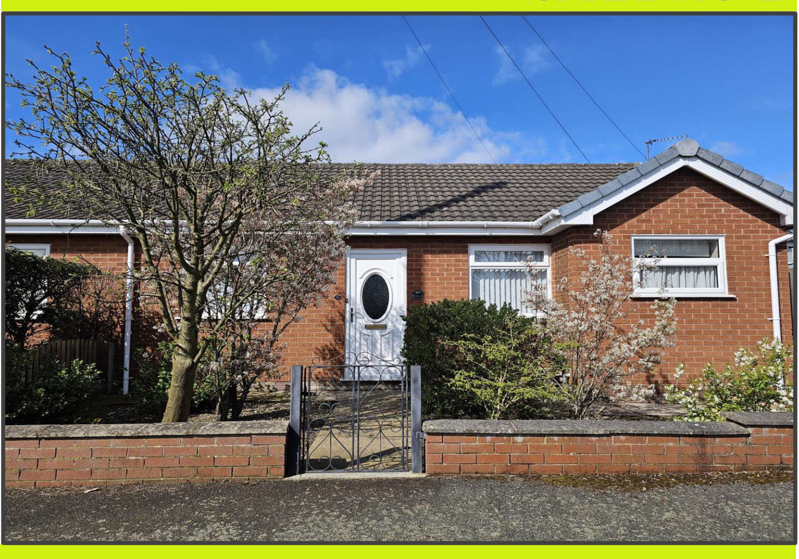
Asking Price £225,000